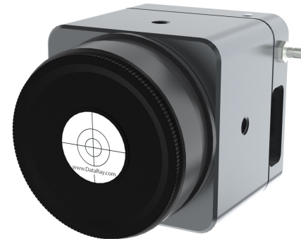
TaperCamD-LCM 2.25 x 2.25 x 2.13 in 57 x 57 x 54 mm

The TaperCamD-LCM is paired with DataRay's full-featured, highly customizable, user-centric software (which has no license fees, unlimited installations, and free software updates). It is perfect for applications including: CW and pulsed laser profiling; field servicing of laser systems; optical assembly; instrument alignment; beam wander and logging; R&D; OEM integration; and quality control.