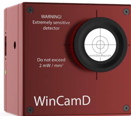
WinCamD-IR-BB 2.8 x 2.8 x 2.0 in 73 x 73 x 52 mm